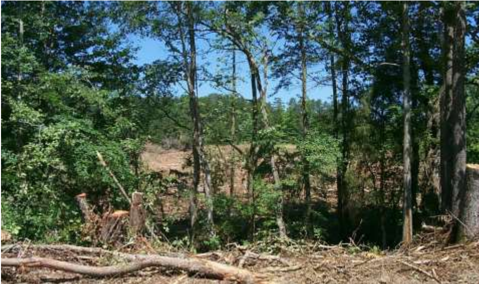
SMZ Retained on a Logging Job