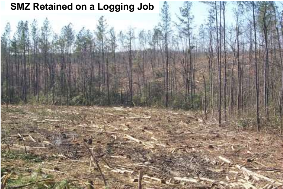
SMZ Retained on a Logging Job