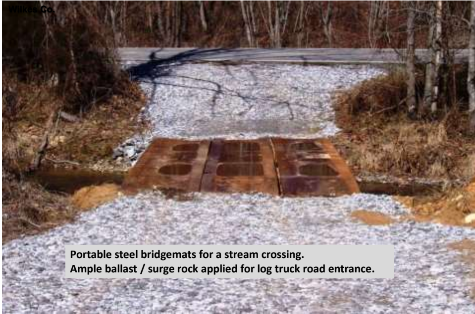
Portable steel bridgemats for a stream crossing. Ample ballast / surge rock applied for log truck road entrance.