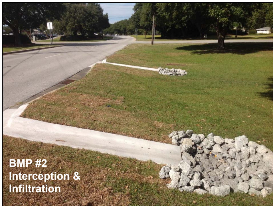
BMP #2 Interception & Infiltration