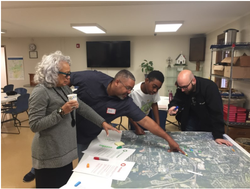
A Family Fun event held at St. Ambrose Church invited community to share ideas about parks.