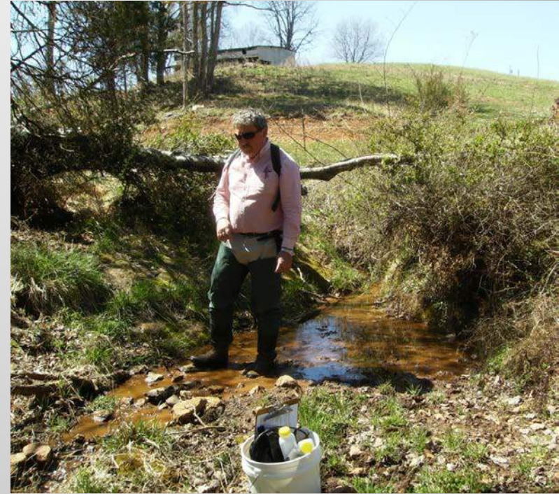
Coordinator Water Quality Monitoring at Hawkins farm

50% of salary and benefits paid for by Stokes County