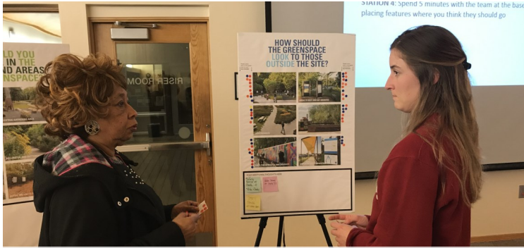
After community engagement, one of two concept designs was selected for the Bailey Drive Gateway site, "A Walk in the Neighborhood."