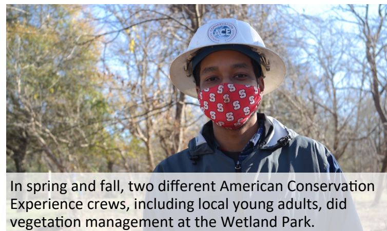
In spring and fall, two different American Conservation Experience crews, including local young adults, did vegetation management at the Wetland Park.