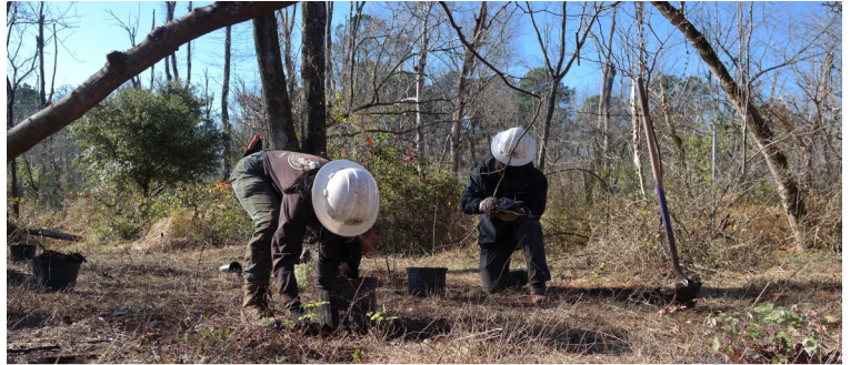
Local crew members planting native plants in an area where they removed invasives.

PEJ has been working with partners to advocate for green infrastructure and community benefits in the proposed Downtown South Project. To receive project updates, visit pejraleighnc.org