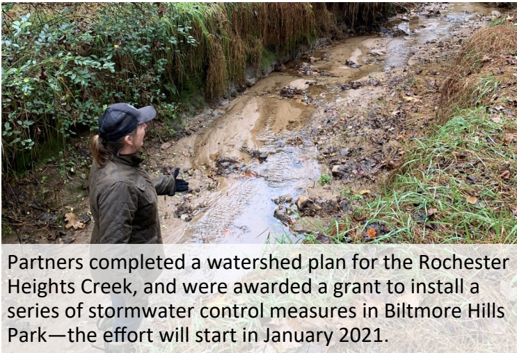
Partners completed a watershed plan for the Rochester Heights Creek, and were awarded a grant to install a series of stormwater control measures in Biltmore Hills Park—the effort will start in January 2021.