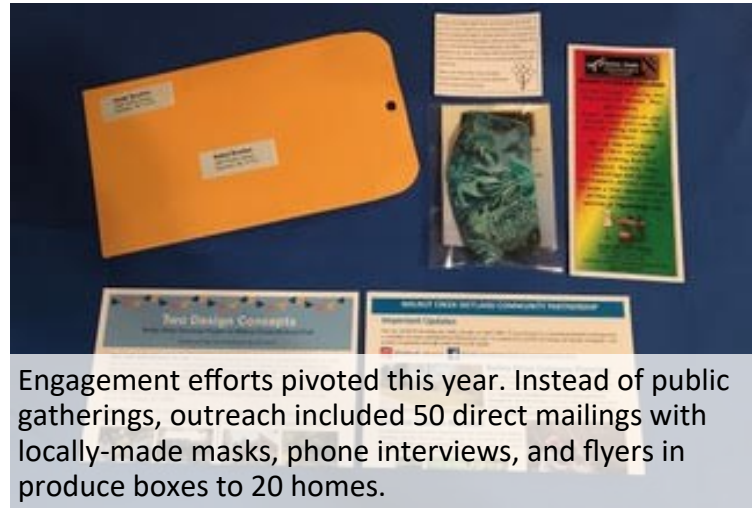
Engagement efforts pivoted this year. Instead of public gatherings, outreach included 50 direct mailings with locally-made masks, phone interviews, and flyers in produce boxes to 20 homes.