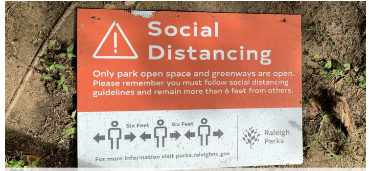
COVID- 19 hit, and the community was called upon to practice social distancing—but our parks and greenways offered a safe outdoor space.